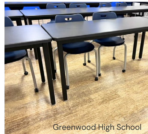
Greenwood High School