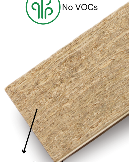
HempWood® PureBond® Plywood — FSC® Certified —