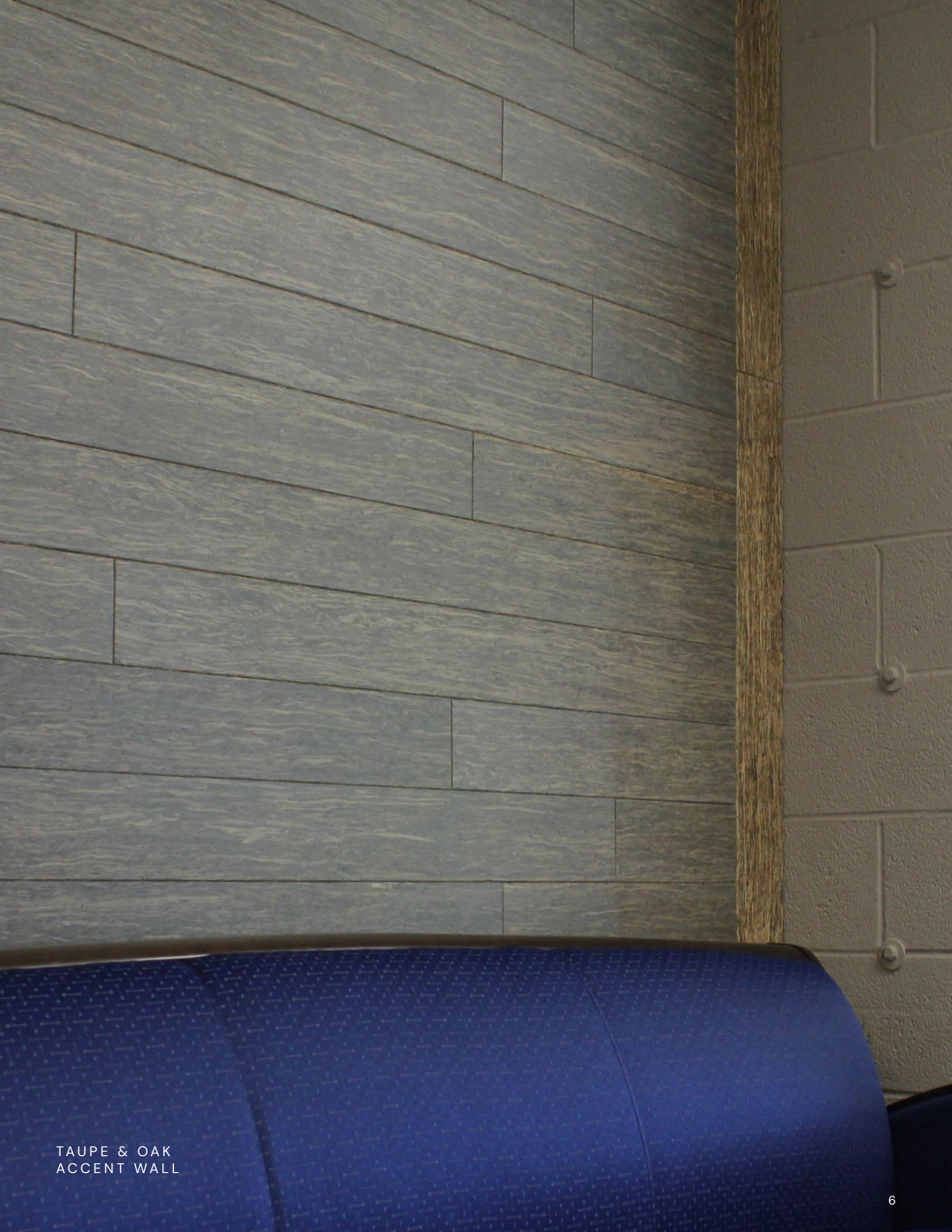
TAUPE & OAK ACCENT WALL