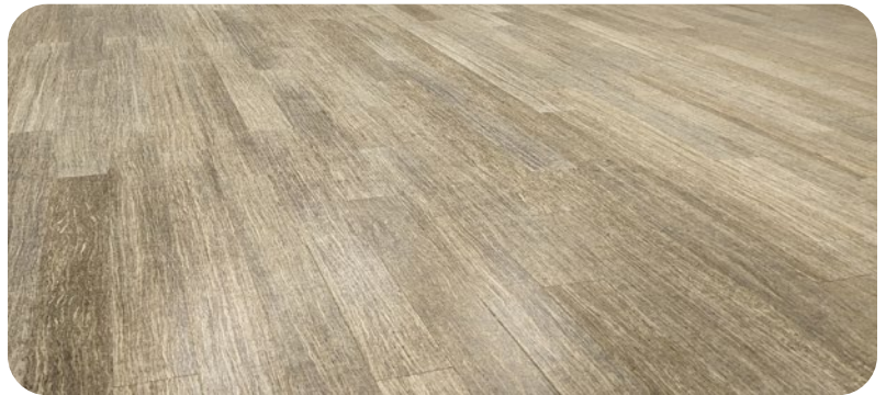
University of Kentucky