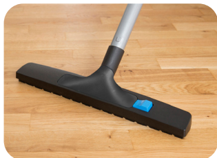
Hard-Surface Floor Tools

You'll breeze through even the toughest cleaning tasks when you have the right tools for the job. From floor to ceiling, garage to family room, powerheads and accessories deliver powerful cleaning performance on carpets, hard flooring, rugs, walls, window treatments, upholstery and more!