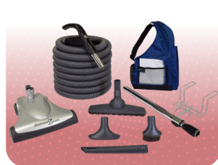
Complete Cleaning Kits