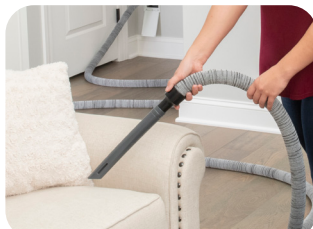
Furniture Cleaning Tools